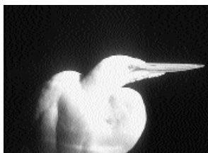
From top left, great egret, common murre, and brown pelican.

Abbotts Lagoon is an excellent place to view winter ducks and raptors. Black-shouldered kites are commonly seen in winter and fall. This is also sensitive nesting area for the federally threatened western snowy plover. Please tread carefully on the sandy beaches during the spring and early summer months.